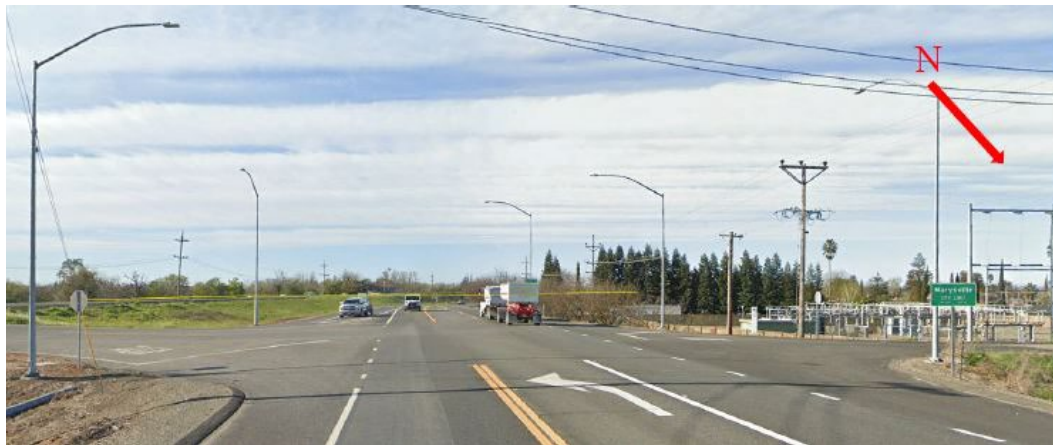
3) Site photo