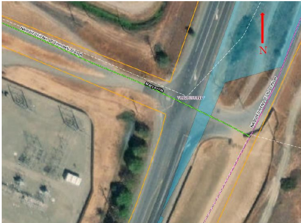
2) Location Map